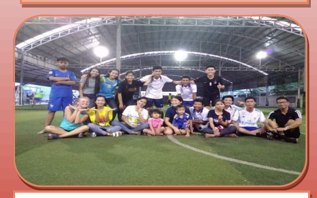
University student fellowship sports day