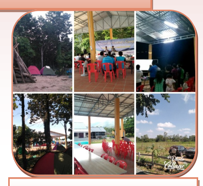
University students camp