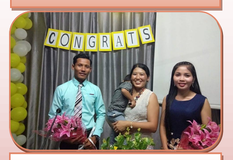
Hall graduates 2018