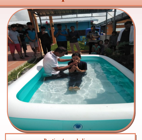
Baptize\ 4\ new\ believers