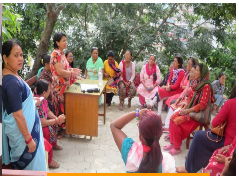
Single women group reform