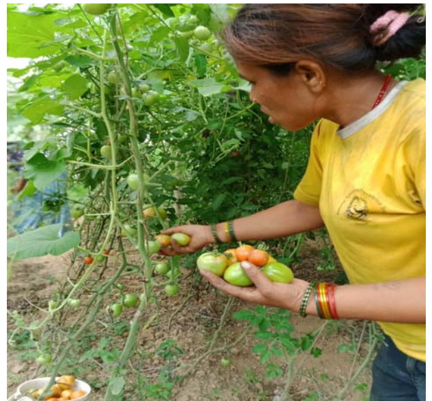
Single women working in farm