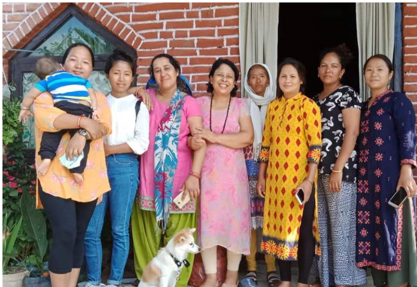
Single women group follow-up at Harisiddi