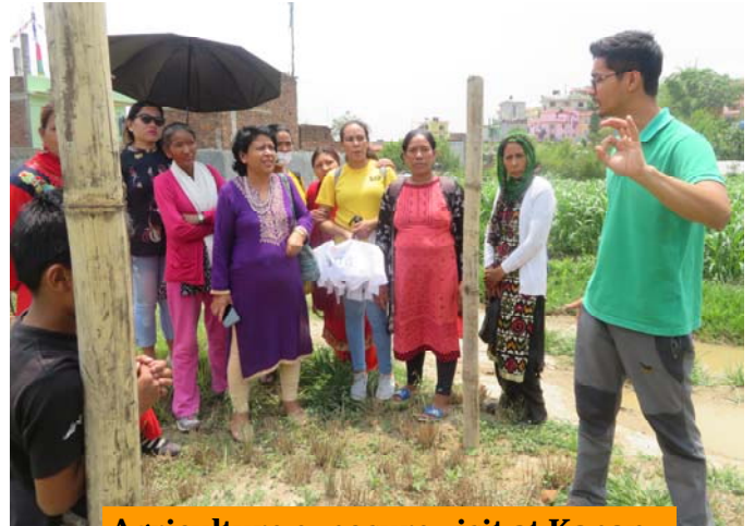
Agriculture exposure visit at Kapan