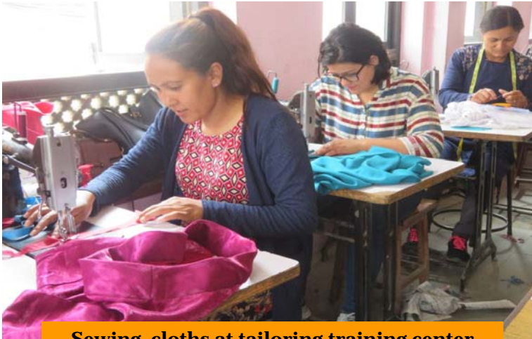
Sewing cloths at tailoring training center