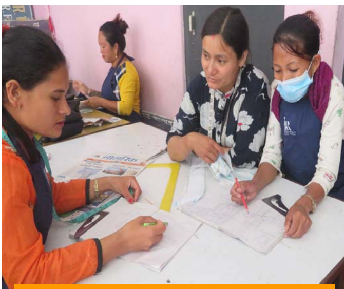
Tailoring participants follow-up